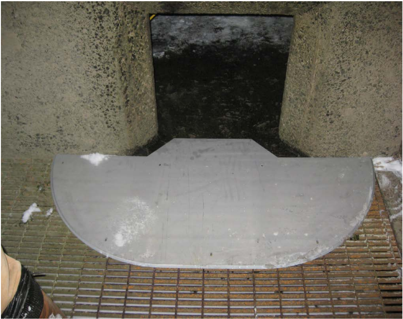
Misfit lamprey plating. New plating to be fabricated and installed this year. This plating to be saved for future Bonneville fishladder installation.